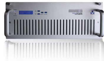
COLDSTORE Colossus Front Panel includes LCD system info and disk status LEDs

COLDSTORE Colossus is ideal for projects requiring affordable high storage capacity, extended disk lifetimes, very long file-retention times and simple system management.